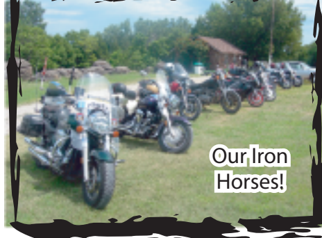
Our Iron Horses!

Our next planned ride is a short one to get Indian Tacos. We will meet at the church Aug. 7 at 11 a.m. and head over to 1111 N. Amidon to the Indian Methodist Church. It is right across the street from the Indian Hills swimming pool. Tacos are $5 and drinks are 50 cents.