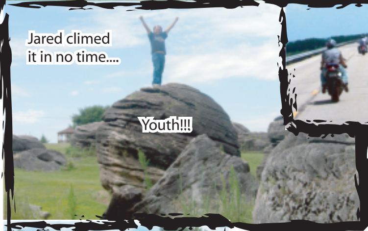
Jared climbed it in no time....