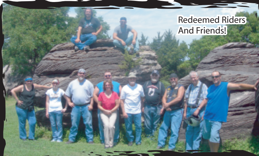
Redeemed Riders And Friends!

pretty scenery! The lake looked very inviting as it was starting to get a little hot by that time.